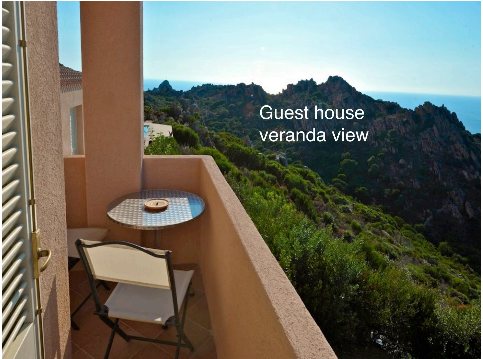
Guest house veranda view